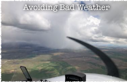
Avoiding Bad Weather