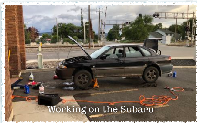
Working on the Subaru