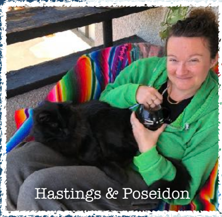
Hastings & Poseidon