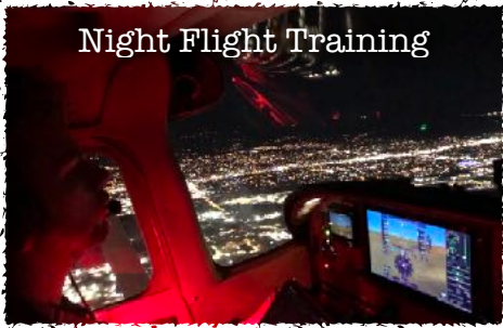
Night Flight Training